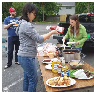
SNL BBQ Games, Burgers, Dogs & S'mores