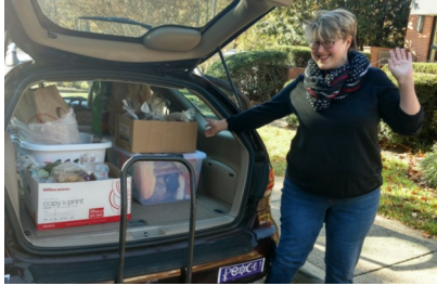
Our Thanksgiving Food Drive donations on their way to the FACETS office