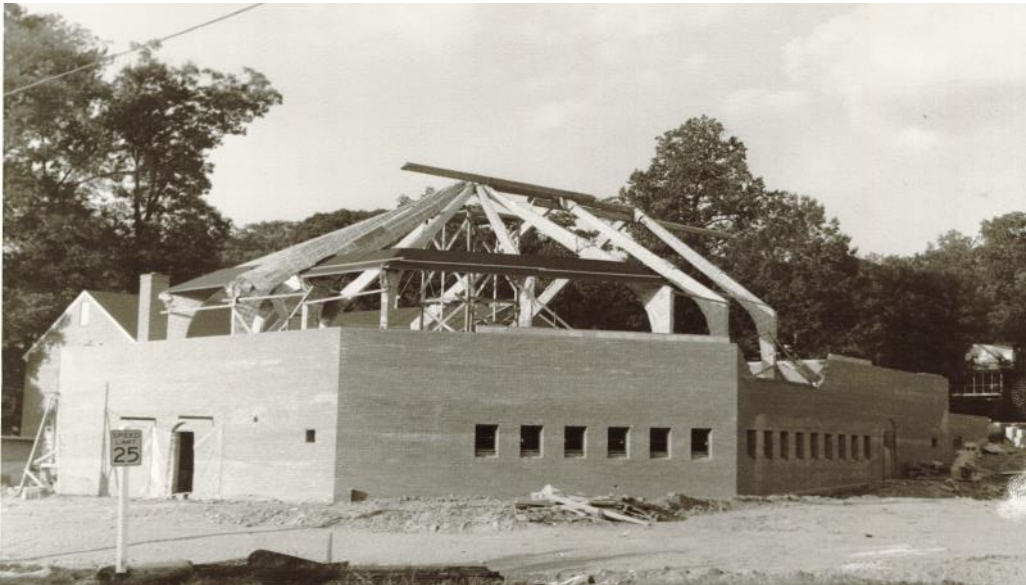
Construction of Roof (upside down boat), July 5th, 1964