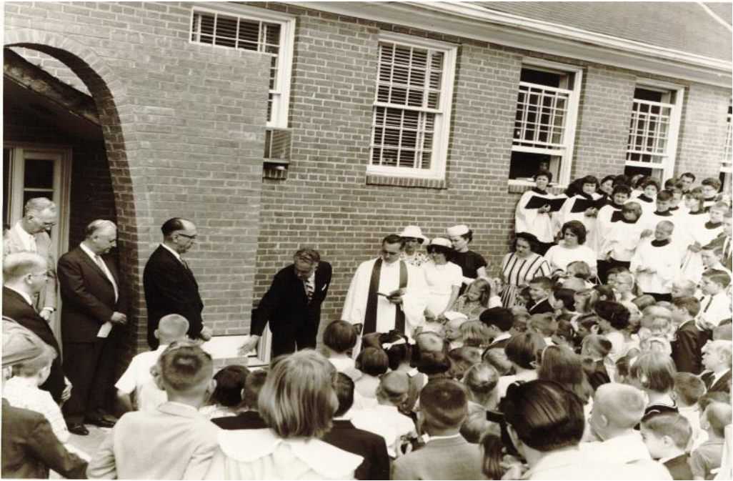
Laying of Cornerstone, June 14th, 1964