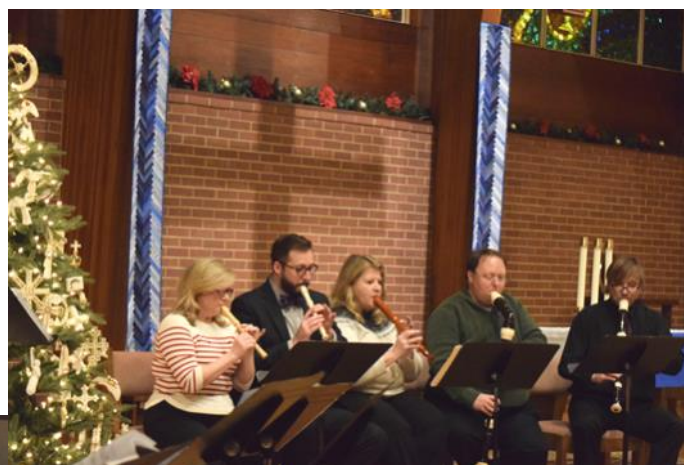
Advent Concert and Cookie Reception December 9, 2018