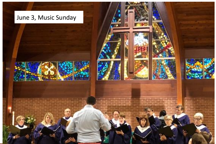
June 3, Music Sunday