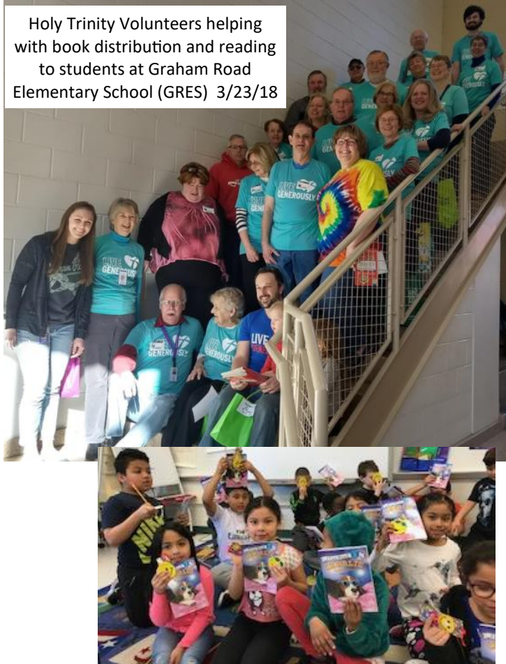
Holy Trinity Volunteers helping with book distribution and reading to students at Graham Road Elementary School (GRES) 3/23/18