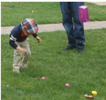
HTLC Easter Egg Hunt