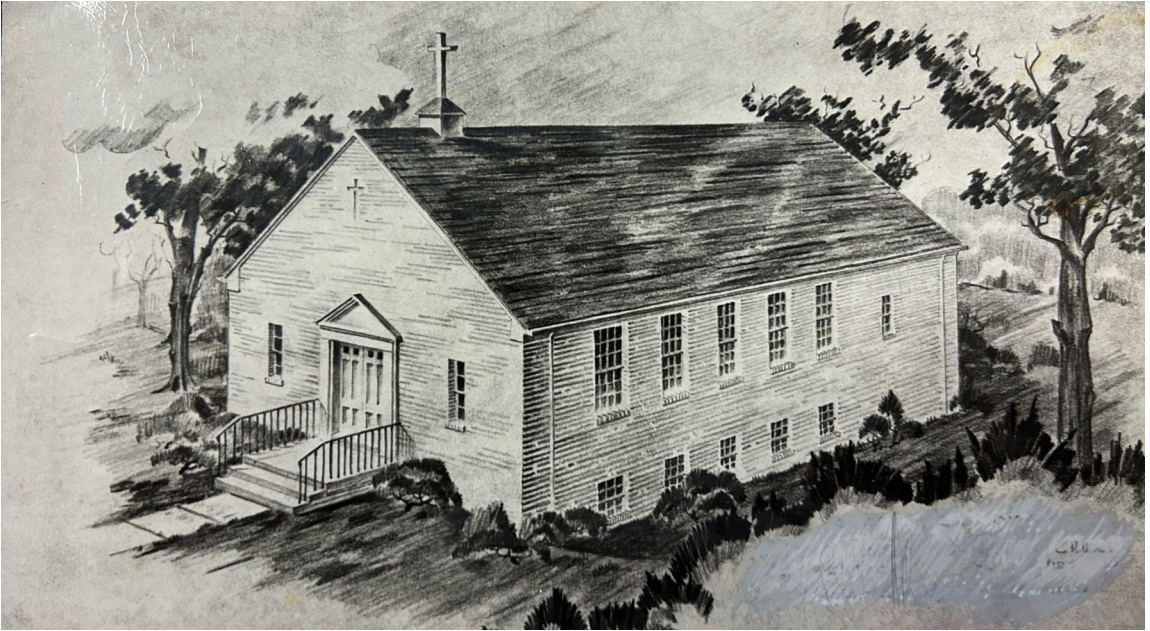
Artist Sketch of Chapel (now Rothenberg Hall) 1951