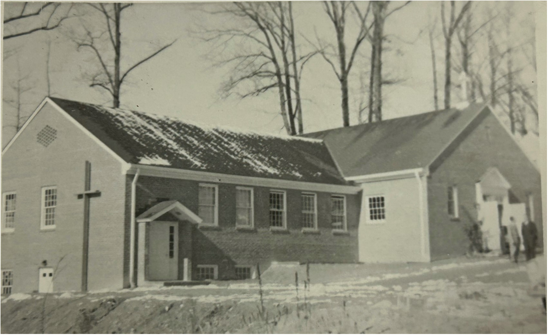
Office/Classroom Addition to Chapel (now Rothenberg Hall) Fall 1955